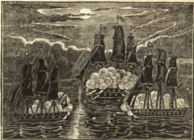
BATTLE OF THE CONSTITUTION WITH THE CYANE AND LEVANT. COMMODORE STEWART.